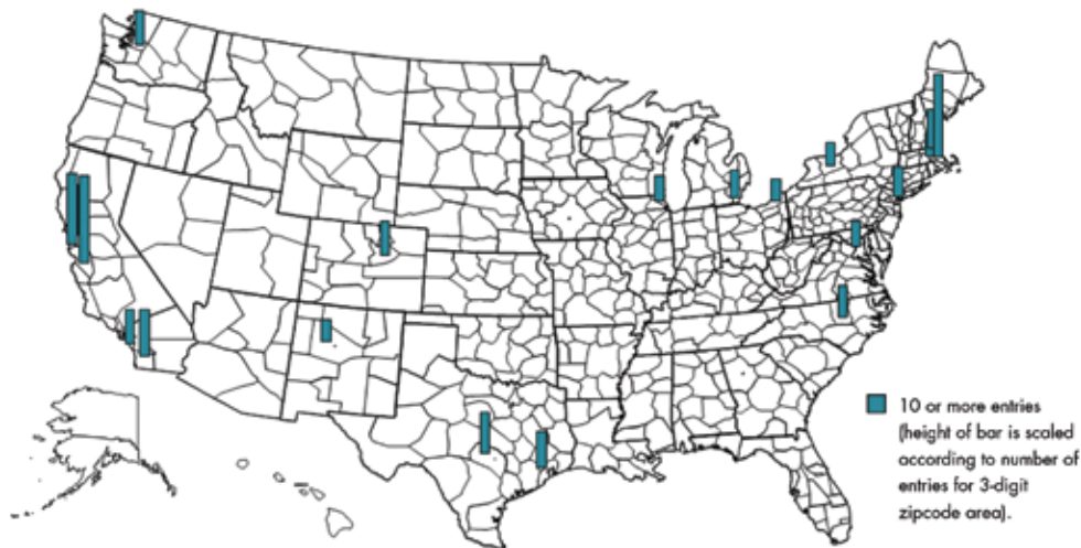
Figure P.1: Concentration of Nano Firms, Universities, Government Laboratories and Other Organizations across the Continental United States